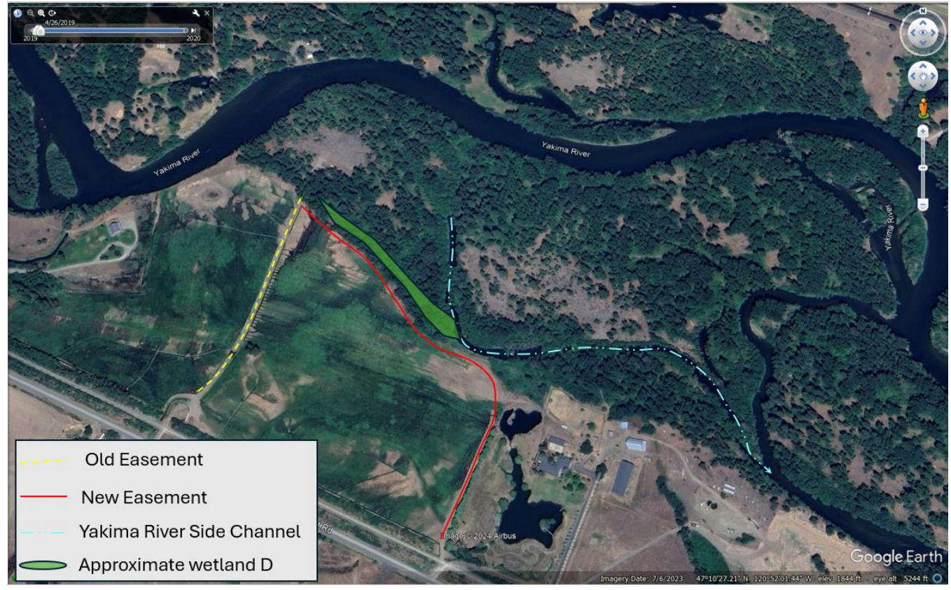
Figure 2 . This recent image from Google Earth has been highlighted with the approximate locations of the old easement, the new easement, Wetland D, and a Yakima River Side Channel. It is intended to demonstrate that this wetland is in direct connection with the Yakima River and falls under the Shoreline jurisdiction (KCC 17B) and not the Critical Area jurisdiction (KCC 17A).

Thank you again for the opportunity to comment and for the County's commitment to protect fish and wildlife habitat conservation areas such as the Yakima River. The Yakima River and its associated floodplain, side channels, wetlands, and riparian forests are of statewide significance and we would be pleased to work together to ensure all potential impacts are appropriately mitigated to protect all Shoreline functions and values for this project. Please let me know if there are any questions about our comments. I can be reached by phone at (509) 961-6639 or email at <a href="mailto:Jennifer.nelson@dfw.wa.gov">Jennifer.nelson@dfw.wa.gov</a>.